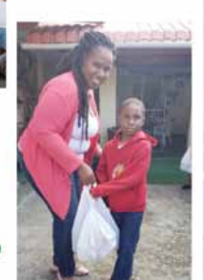
Giving back to the Community December 2019

credit union and where do youths see themselves in the credit union movement).